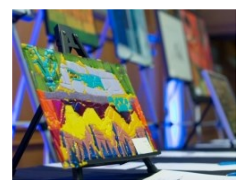
(Above) The holidays will be a little merrier for the artists who sold art at Here's Nina!

(Cover photo) Artists from the Nina Collective wish you and yours the best of the holiday season and a creative new year in 2016!