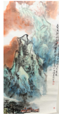
Visiting artists from Chengdu created this beautiful painting in the Nina stu-